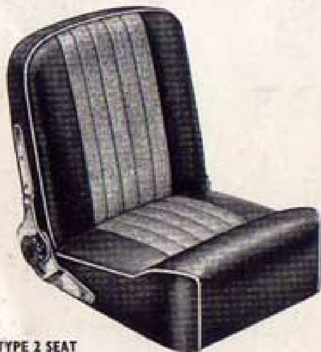
TYPE 2 SEAT