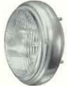
683 Diameter 5 1/2" Depth 2 1/2" 12 v. D.P. Plain or Fluted Lens Chrome.