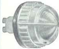
1323/N Diameter at base 2 1/2" Also supplied with Red lens as Rear Lamp.