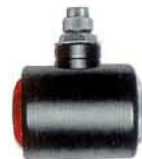
TRACTOR COMBINED SIDE AND REAR LAMP