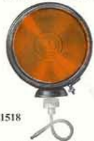
1518 Double Amber or alternate Red or White Lens Front to Rear 2" Overall height 5" Dia. 4 1/2"