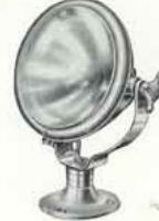
1373 Diameter 5 1/2" Chromium Plate on brass or Lacquered Brass.