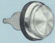
1635 Amber, Red or White Lens Diameter 2 1/2"