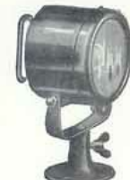
970 Diameter 5 1/2" Bright Black enamel.