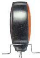
1518/CD Single Amber Lens. Bracket mounting.