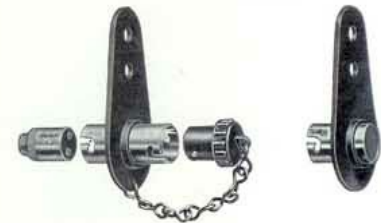
1091/A (Dummy connector Type 1100 also available).

SUPPLIED SINGLE OR DOUBLE POLE FOR 6 volt, 12 volt or 24 volt CIRCUITS