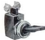
1709 Screwed Stem 1/8"