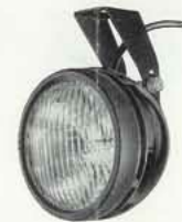
TRACTOR HEADLAMP Sealed Beam