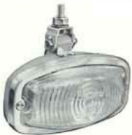
1691 Length 4 1/2" Depth 2 1/2" Width 2 1/2" Polypropylene body. Diakon Lens.