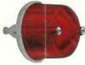
1626 Diameter 3 1/2" Depth 3" Also supplied Amber Lens as Direction Indicator Type 1627.