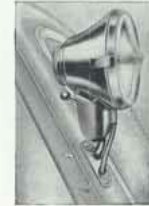
1573 Left Hand or Right Hand fitting. Diameter 4 1/2" Chrome.