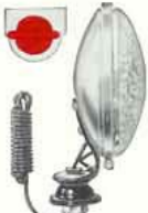
1547 Illuminated Switch. Diameter 4 1/2" Depth 2 1/2" Chrome.