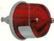
1594 Diameter 3 1/2" Depth 3"