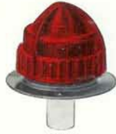
1323/D Diameter of flange 2 1/2" Guard available Type 1483