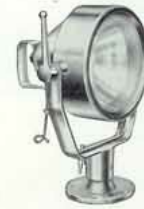
1331 Diameter 7 1/2" Height 13 1/2" Width 11 1/2". Approved Admiralty alloy, highly polished.