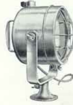
896 Diameter 8" Chromium Plate on brass or Bright Black stove enamel.