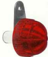
1323/A With bracket. Diameter at base 2 1/2"