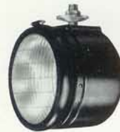
HEAD OR WORK LAMP