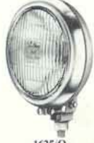
1625/Q Plain or Fluted Lens 12 v. 55 w. S.P.