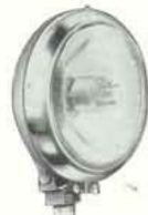
1625 Plain or Fluted Lens Vertical or Pendant Mounting