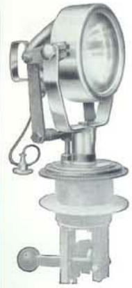
1321 Diameter 7 1/2" Height 23" Width 12" Remote control through 360°. Approved Admiralty alloy, highly polished.