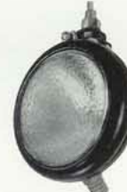
TRACTOR PLOUGH LAMP