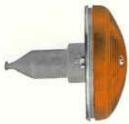
1595 Amber Lens Diameter 4" Depth 1 1/2"