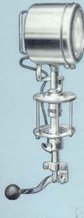
1121 Diameter 5 1/2" Remote control through 360° Chromium Plate on brass, or Black Enamel.