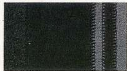
Silver Grey Stripe