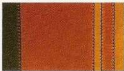
Orange Brown Stripe